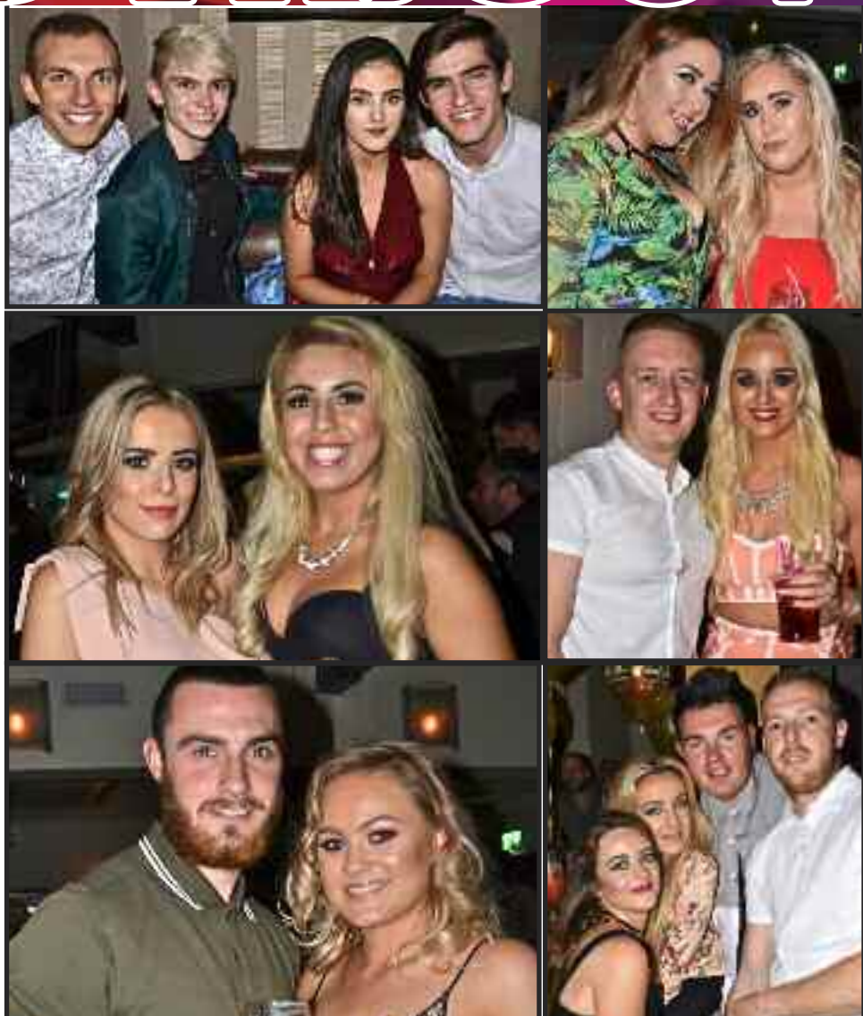
Enjoying a great night out the Black Forge Inn