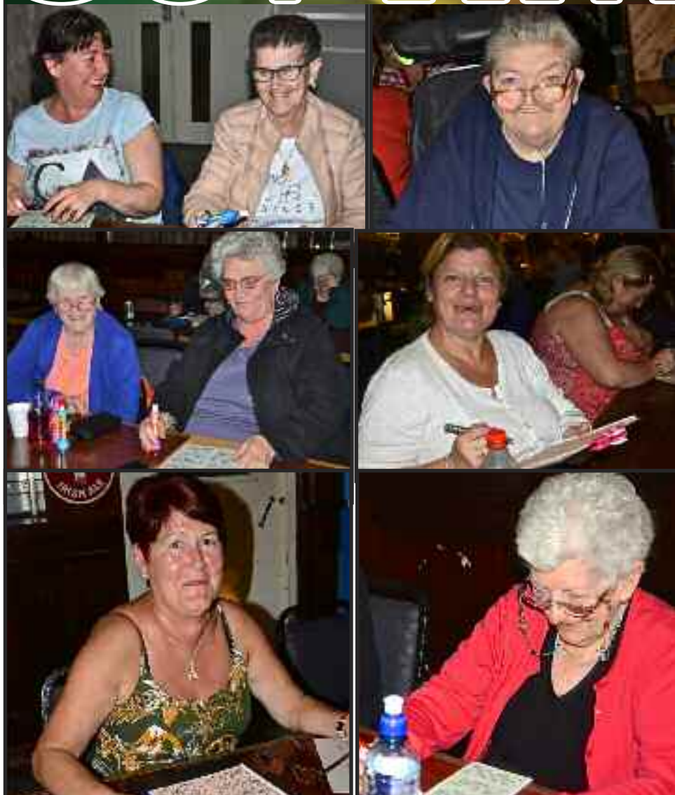
Enjoying the New Century Bingo at the Transport Club