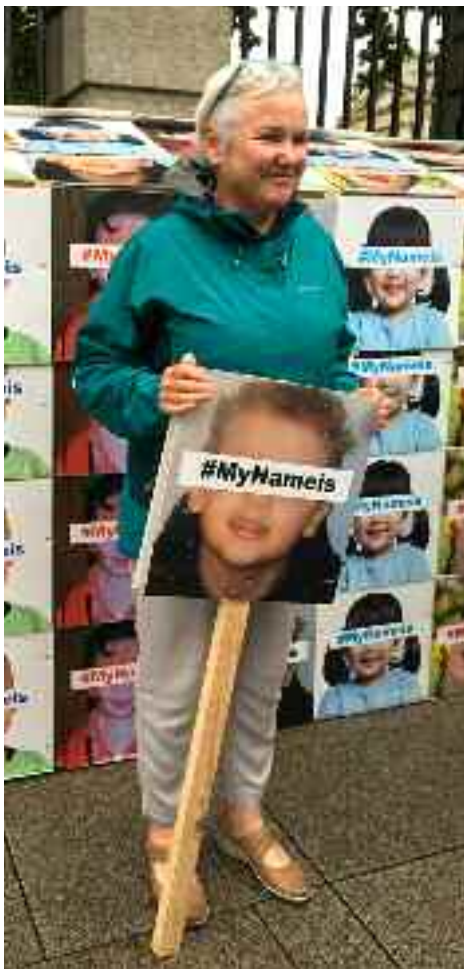
'Brid Smith TD outside Dáil Éireann with the wonderful #MyNameIs homeless campaign'

evictions and house repossession. NO! It would infringe the property rights of landlords and banks. (We put forward such a Bill last year but it was defeated on the casting vote of the Fianna Fail Ceann Comhairle).