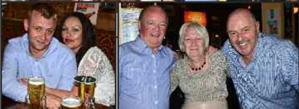
Great night out at the Clock