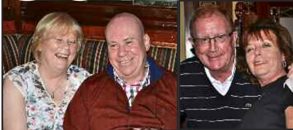
Enjoying a great night out at the Village Inn