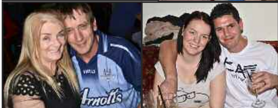
Enjoying a great night out at Clearys