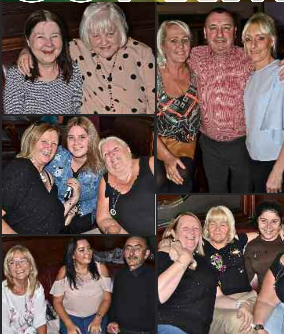
Enjoying a great night out at the Lamp Lighter