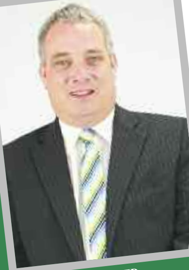
Aengus Ó Snodaigh TD