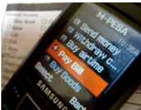
M-PESA IN ACTION: bottom-of-the-line phones can handle money

The problem? That buyers and sellers in poor countries — and poor people around the world — cannot afford expensive