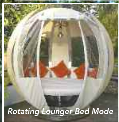
Rotating Lounge Bed Mode

A garden should be enjoyed so make it somewhere to relax and unwind.