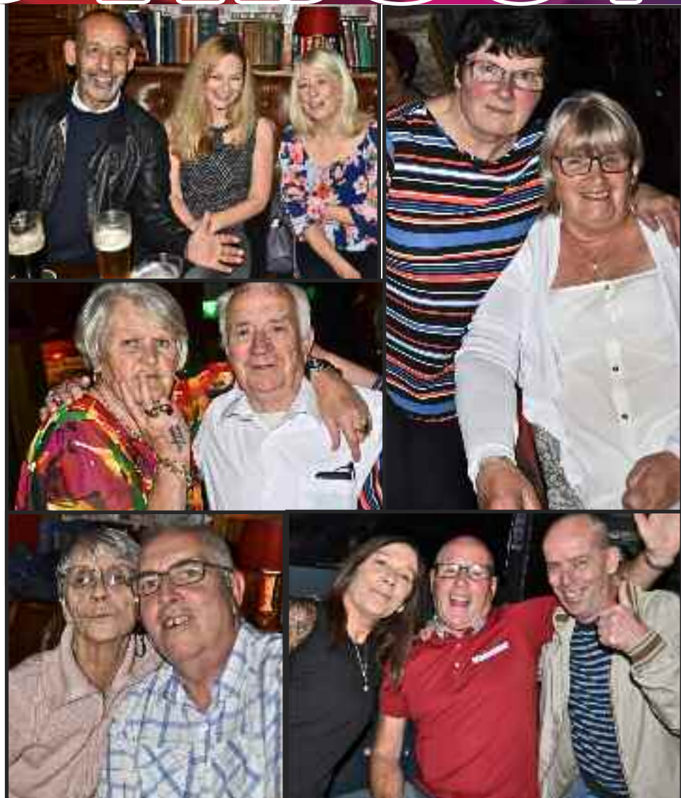
Great night out at the Marble Arch