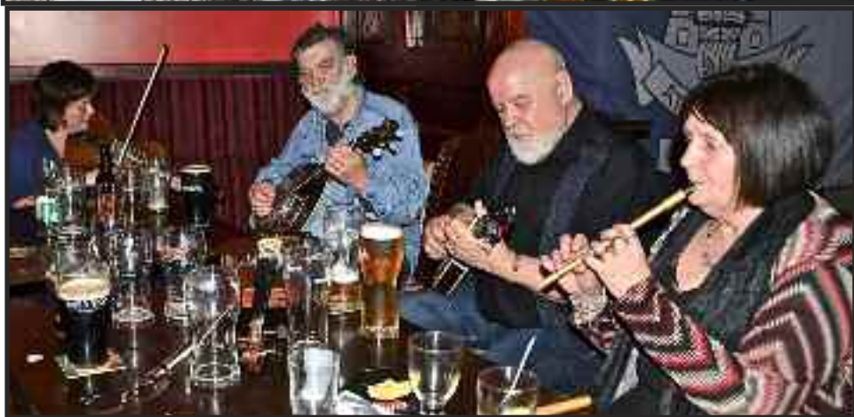
Enjoying a great night out at the Long Mile Inn