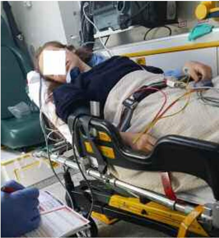
“NIAMH”: took ill after receiving Gardasil, the HSE’s anti-HPV vaccine