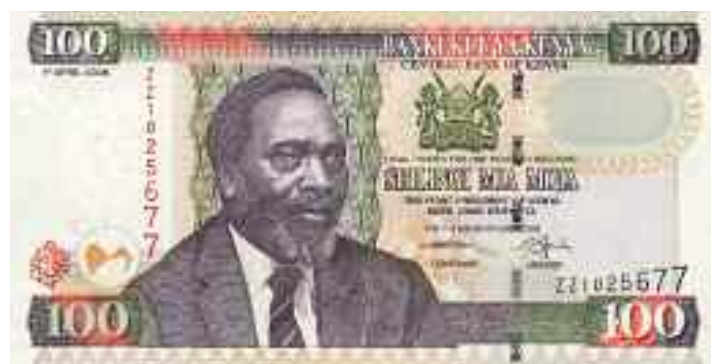
THE UNLOVED KES: Kenya's paper shillings are falling out of favour