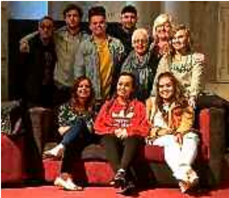
THE CAST: 'Bring me Back Alive'