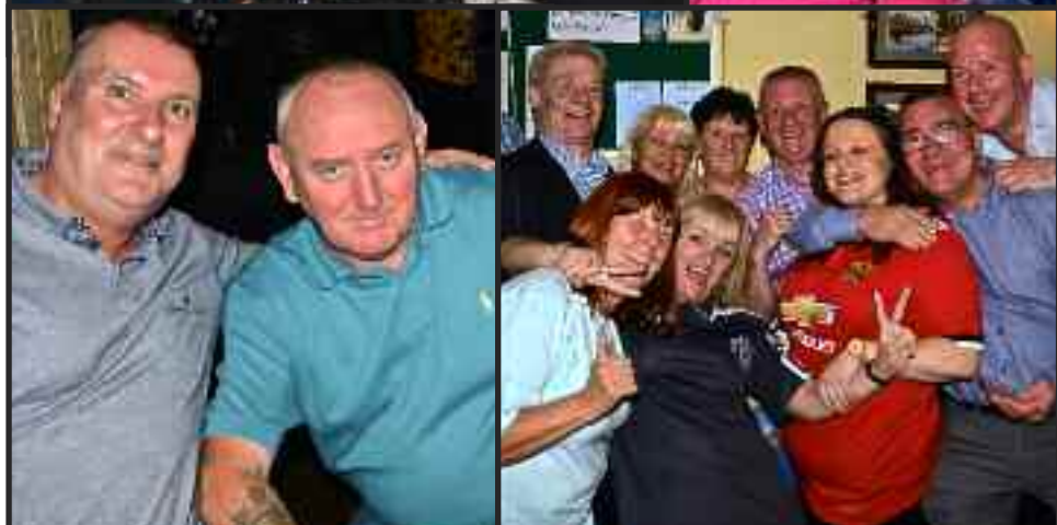
Enjoying the live entertainment at Tom Kennedys