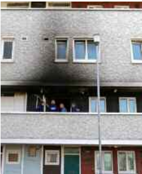
FIRST FLOOR FIRE: investigations continue

the assistance of the Green family. But it was young John Green who saved the day, turning back to rescue mum Maggie when she had become trapped in a smoke-filled bedroom. BLACKENED Neighbours reported that the children were "limp and totally blackened" when they were removed by ambulance and rescue services. Hero John was later stabilised in Crumlin Children's Hospital, but