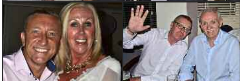
Enjoying a great night out at The Transport Club