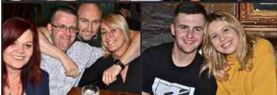
Enjoying a great night out at Eleanora's