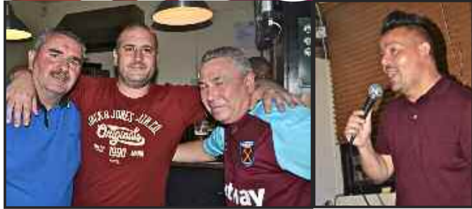
Enjoying a great night out at the Malt