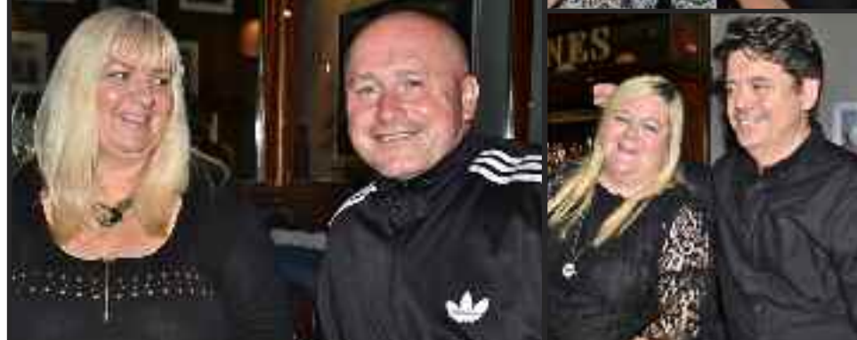
Enjoying a great night out at the Stoneboat