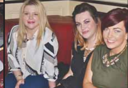
Enjoying a great night out at the 79 Inn