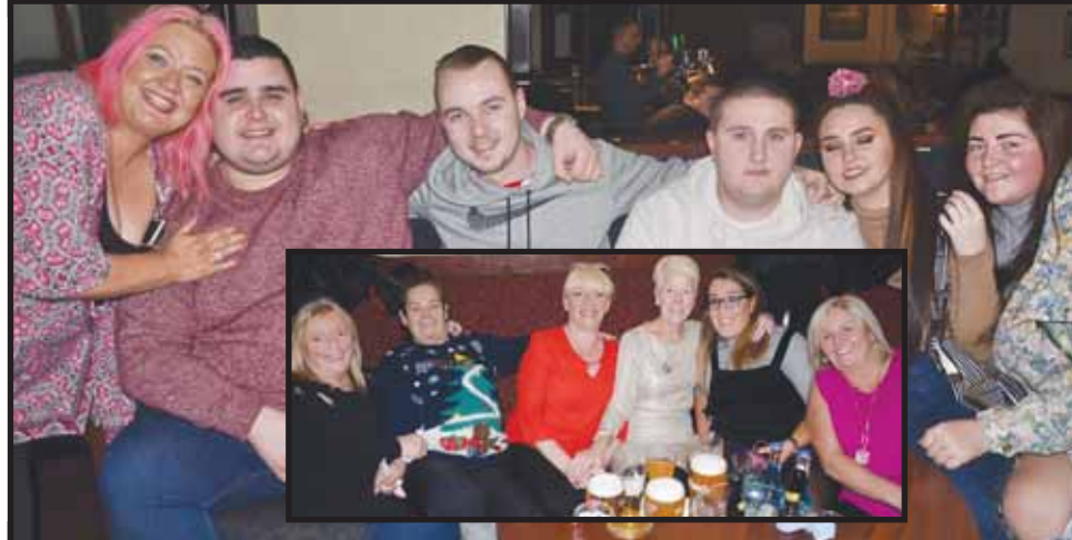
Enjoying a night out at The Barn House