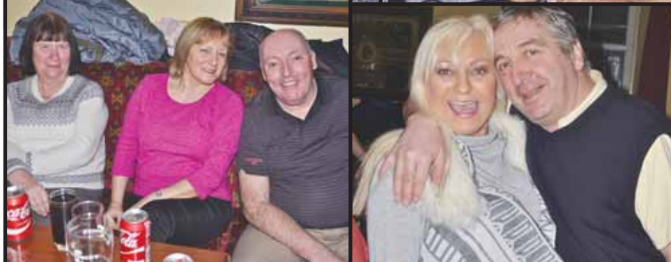
Enjoying a great night out at Cleary's Pub