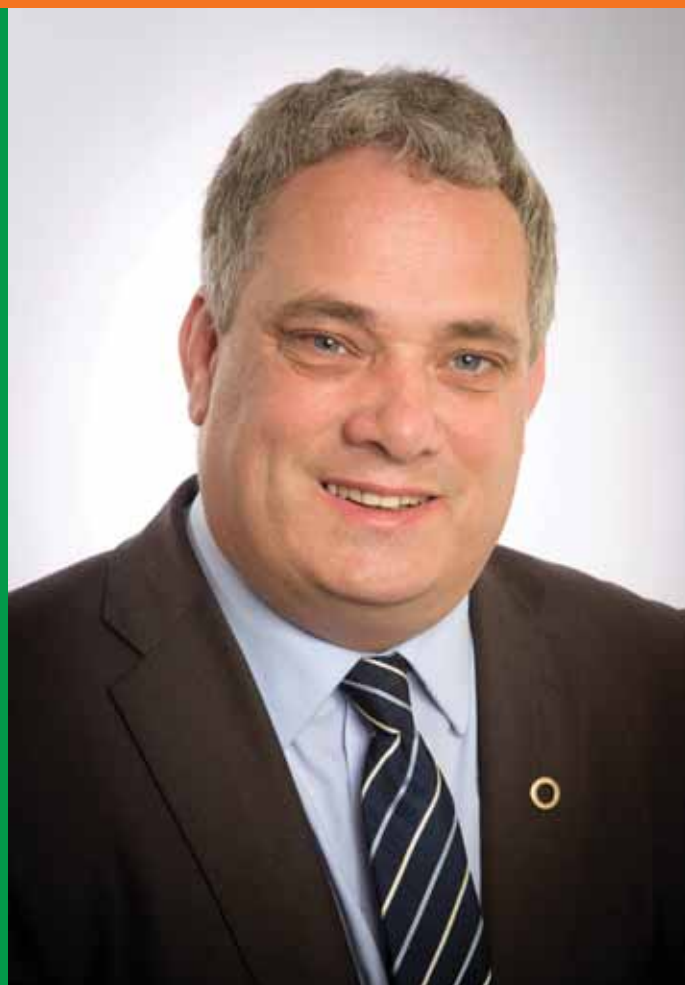
Aengus Ó Snodaigh TD