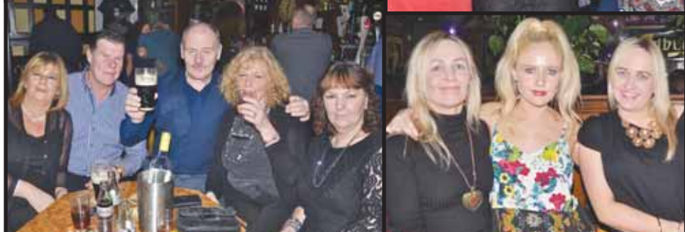
Great night out at Eleanora's