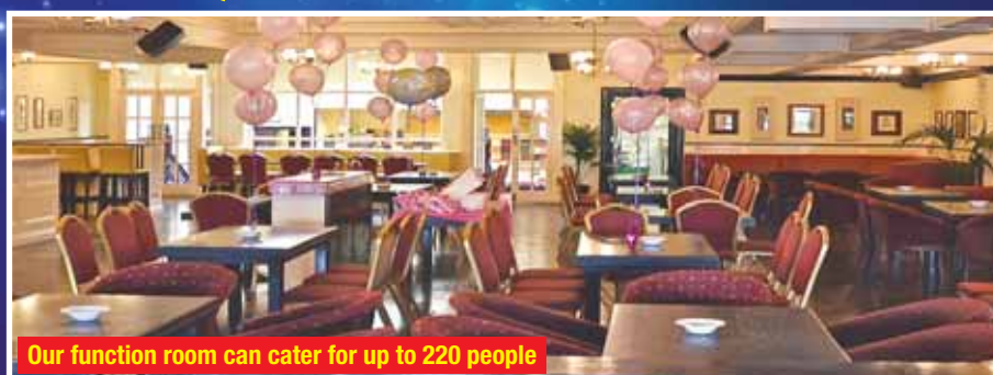
Our function room can cater for up to 220 people