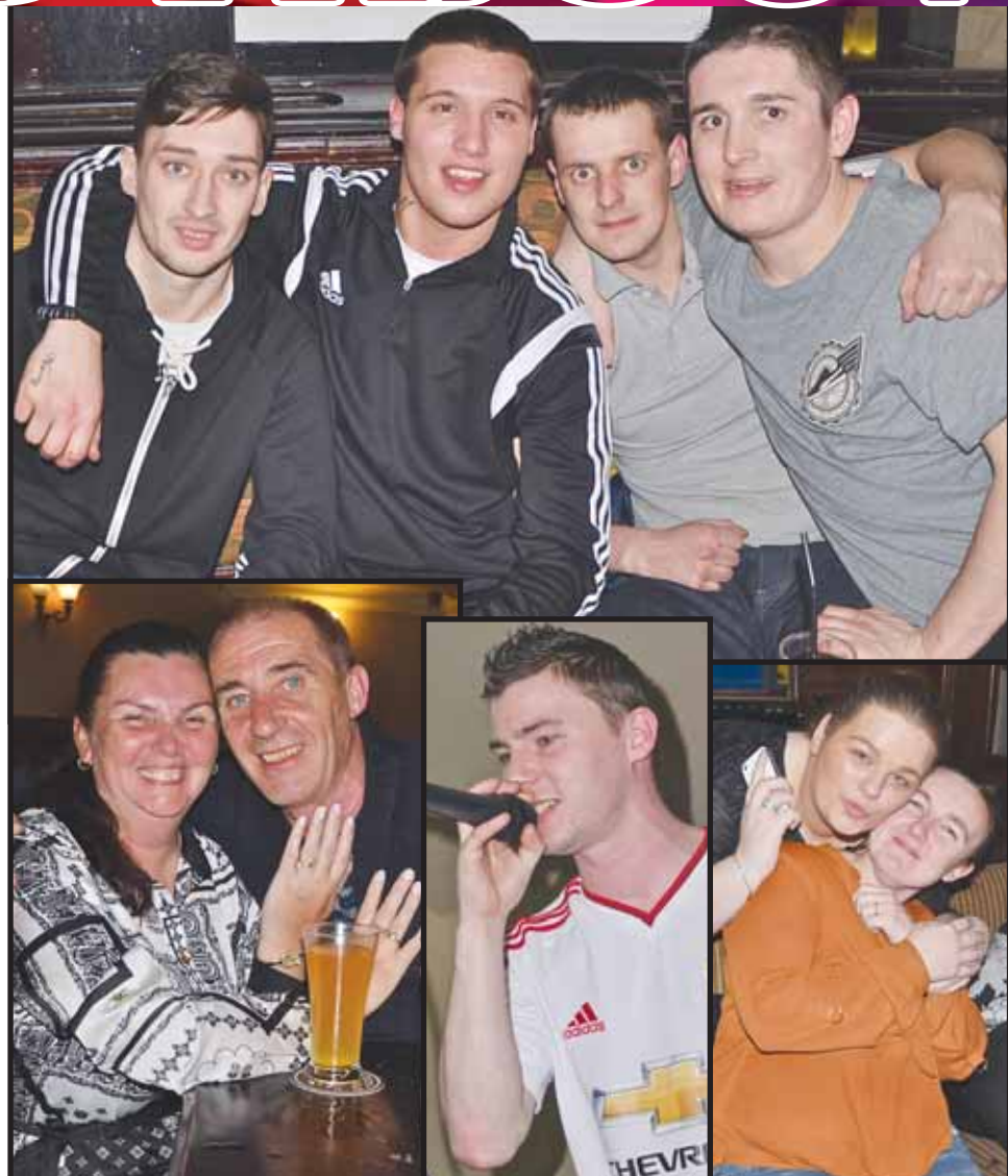
Great night out at the Four Roads