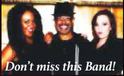
Don't miss this Band!