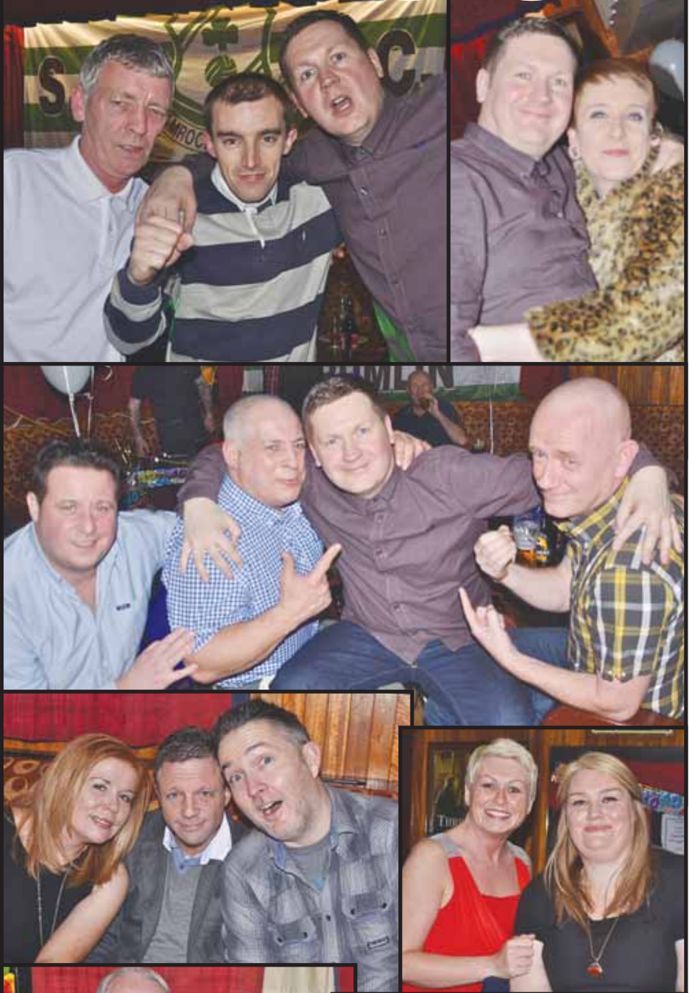
Great night out at the Village Inn