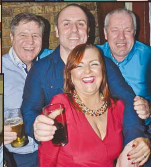
Enjoying the live entertainment at Tom Kennedys