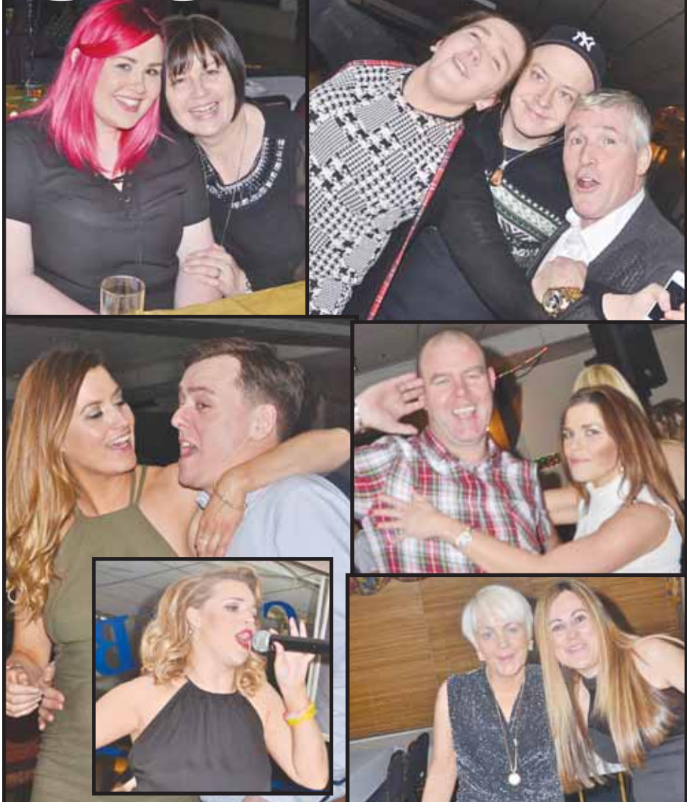
Enjoying a great night out at the Transport Club