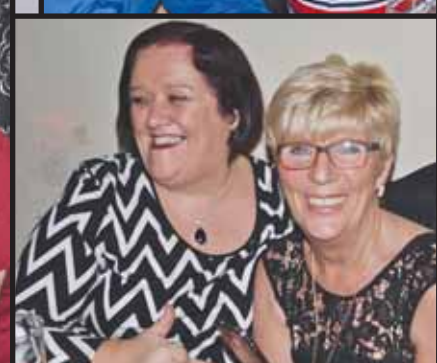
Enjoying a great night out at the Black Forge Inn