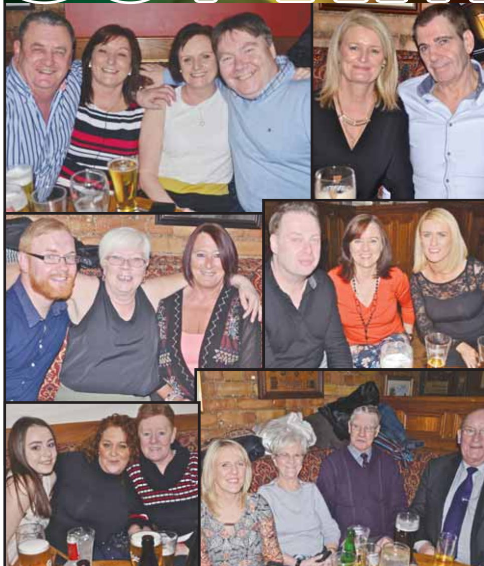
Enjoying a great night out at The Clock