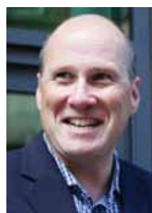
ATES: poll prophecy

"Now the brains of the Labour operation are disappearing. You have five big